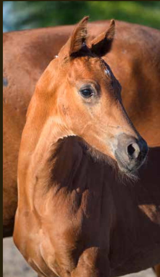
Chestnut · Stallion | 15 - 06 - 2018

Vince the Prince S is an offspring out of the superior Dodona-line of Ahlerich, Amon, Rembrandt and Rubinstein. The line has produced multiple approved stallions and successful dressage horses, among them the stallion Bordeaux. Vince the Prince S' granddam Fatinels is a full-sister to the elite stallion Rubinstein. As a broodmare, she "earned her spurs" by producing the Grand Prix dressage horse Patinels, the international Young Riders horse Saphier vh Overwater and multiple successful horses in dressage, show jumping and eventing. Vince the Prince S' dam Fatinel I SHR is a daughter of the stallion Armani, whose dam is a full-sister to Adelinde Cornelissen's horse Parzival, thus uniting two of Europe's best dressage dam-lines. Add to these bloodlines Vince the Prince S' sire Vitalis, who in recent years has distinguished himself as a true top sire in European dressage horses breeding, and you have a recipe for success. Vince the Prince S is a modern dressage foal with long legs and abundant presence, who moves with lovely body position, elasticity and good carriage.