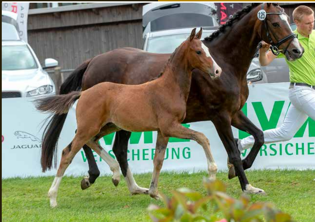
Bay · Stallion | 20 - 04 - 2018