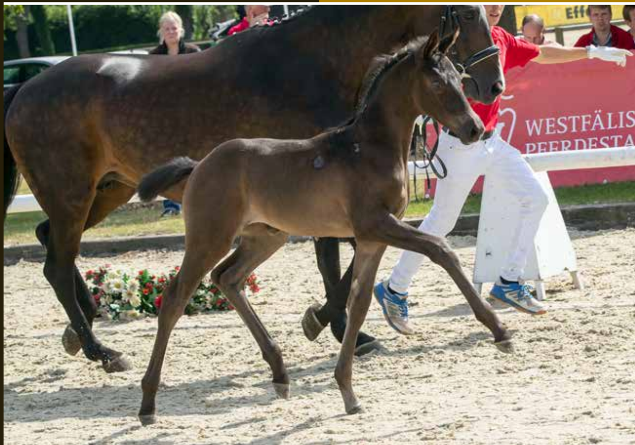
Black bay · Mare | 18 - 06 - 2018