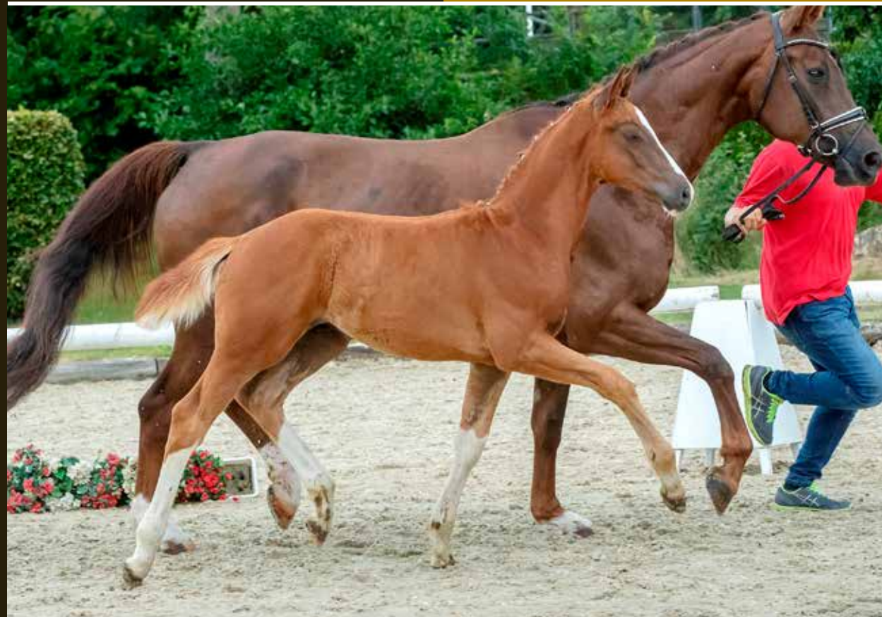
Dark chestnut • Stallion | 17 - 04 - 2018